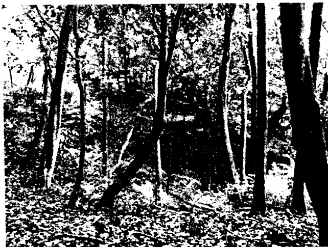
Fig. 6. Taraire forest, Te Matuku Scenic Reserve, 25 Oct 2008.

filiforme , B. chambersii , B. novaezealandiae , Doodia australis , Polystichum wawranum and Pteris macilenta .