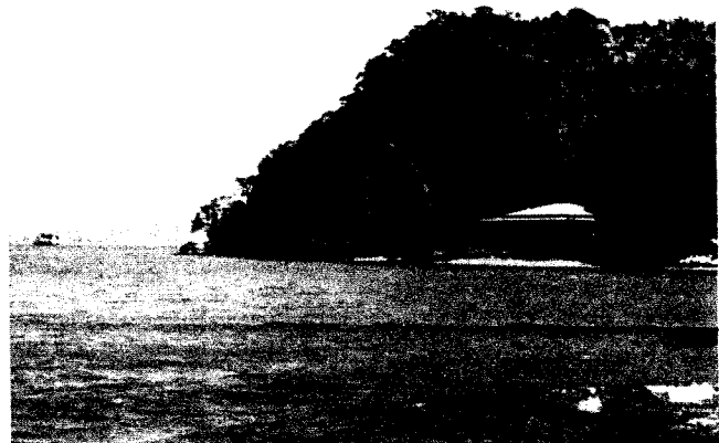
Fig. 2. Otakawhe Bay Lodge and Hunterville Reserve, 22 Sep 2008.

large pohutukawa ( Metrosideros excelsa ) prominent, and beneath them karo ( Pittosporum crassifolium ), houpara ( Pseudopanax lessonii ), kawakawa ( Macropiper excelsum ), and coastal karamu ( Coprosma macrocarpa ). Other native shrubs commonly fringing the track were akepiro ( Olearia furfuracea ), mahoe ( Melicytus ramiflorus ), coastal veronica ( Hebe macrocarpa ), mapou ( Myrsine australis ), karamu ( Coprosma robusta ), Coprosma rhamnoides , mingimingi ( Leucopogon fasciculatus ), coastal astelia ( Astelia banksii ) and manuka ( Leptospermum scoparium ).