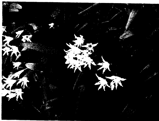
Fig. 8. Gladiolus nanus , Waikopou Bay, Waiheke 27 Oct 2008.

The beach at Waikopua Bay was stony. Several large pohutukawa trees adorned the shore, and there were several massive Monterey cypress and numerous old black wattle bordering the lower stretches of the access road. Of interest were three unusual exotic species – a patch of stinkweed ( Dittrichia suaveolens ), Gladiolus nanus in flower and seemingly wild beside the BBQ on the City Council Esplanade Reserve, and Lonicera x americana in a private garden.