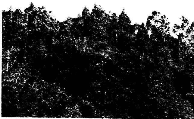
Fig. 7. Kauri forest, Waikopua Bay, 27 Oct 2008.

We had a look at the vegetation at the Waiheke Pioneer Cemetery beside the Onetangi-Orapiu Road and found it to be similar to that in the Goodwin Reserve. There was a large Port Orford cedar ( Chamaecyparis lawsoniana ) beside the graves, with plentiful Morelotia affinis , Drosera auriculata and Gonocarpus incanus .