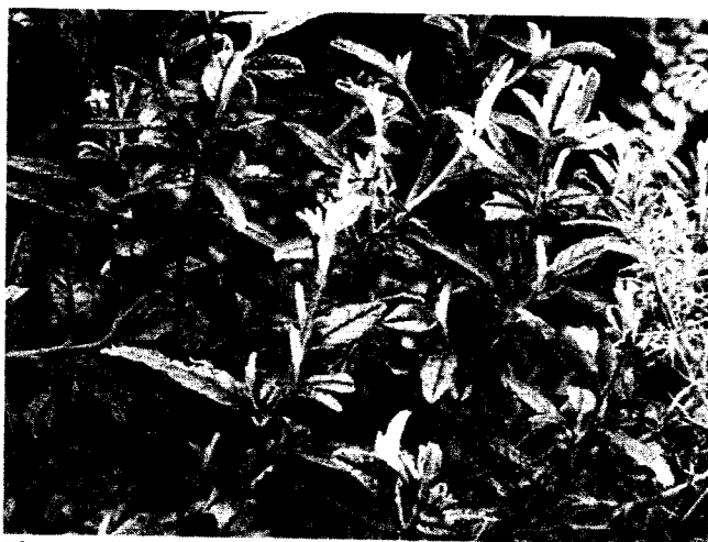
Fig. 3. Pomaderris rugosa , Pearl Bay, 25 Oct 2008.

lower trunks of native trees. Its relative, smilax ( Asparagus asparagoides ), was also present. We can then list the assemblage of other weeds: cotoneaster ( Cotoneaster glaucophyllus ), woolly nightshade