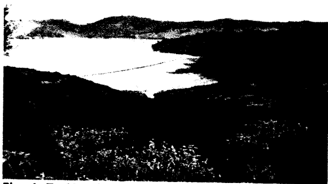
Fig. 4. Te Matuku Bay and shell bank, 22 Sep 2008.

( Solanum mauritianum ), Chinese privet ( Ligustrum sinense ), gorse ( Ulex europaeus ), lilly pilly ( Syzygium smithii ), brush wattle ( Paraserianthes lophantha ), jasmine ( Jasminum polyanthum ), Cape ivy ( Senecio angulatus ), ox-tongue ( Helminthotheca echioides ), purple top ( Verbena bonariensis ), boneseed ( Chrysanthemoides monolifera ), moth plant ( Araujia sericifera ), honeysuckle ( Lonicera japonica ), Sexton's pride ( Rhaphiolepis umbellata ), Spanish heath ( Erica lusitanica ), pampas grass ( Cortaderia selloana ), kahili ginger ( Hedychium gardnerianum ), Mexican daisy ( Erigeron karvinskianus ), grey sedge ( Carex divulsa ) and ladder fern ( Nephrolepis cordata ). Rhamnus ( Rhamnus alaternus ) was absent!. Noteworthy planted trees were Moreton Bay fig ( Ficus macrophylla ) at the lodge, Monterey pine ( Pinus radiata ) and Monterey cypress ( Cupressus macrocarpa ), and salt cedar ( Tamarix ramoissima ) on the foreshore by the lodge.