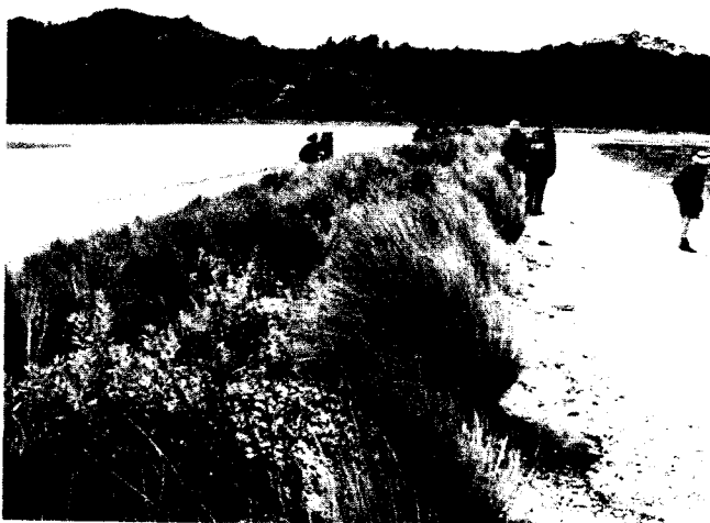
Fig. 5. Austrostipa stipoides and Haloragis erecta on the shell bank, Te Matuku Bay, 25 Oct 2008.

There were also numerous introduced herbs and monocots, with particularly abundant ones being scarlet pimpernel ( Anagallis arvensis var. arvensis ), blue pimpernel ( Anagallis arvensis var. coerulea ), doves-foot cranesbill ( Geranium molle ), cut-leaf cranesbill ( Geranium dissectum ), grassland forget-me-not ( Myosotis discolor ), small-flowered buttercup ( Ranunculus parviflorus ) and yellow flax ( Linum trigynum ). Other exotics worth mentioning were caper spurge ( Euphorbia lathyris ) growing near the lodge, Himalayan honeysuckle ( Leycesteria formosa ), black wattle ( Acacia mearnsii ) and several grasses, notably wild oat ( Avena barbata ), sweet vernal ( Anthoxanthum odoratum ), ripgut brome ( Bromus diandrus ), red-leg grass ( Bothriochloa macra ) and short-hair plume grass ( Dichelachne rara ).